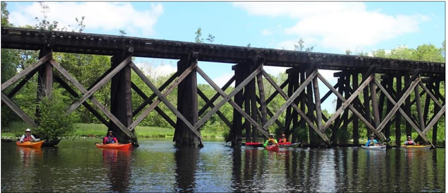
Paddlers practice social distancing along the disused rail bridge on the Tuckahoe above Hillsboro.