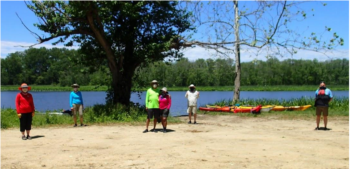
CPA members wear masks and social distance during a lunch stop at Stoney Point on the Tuckahoe.