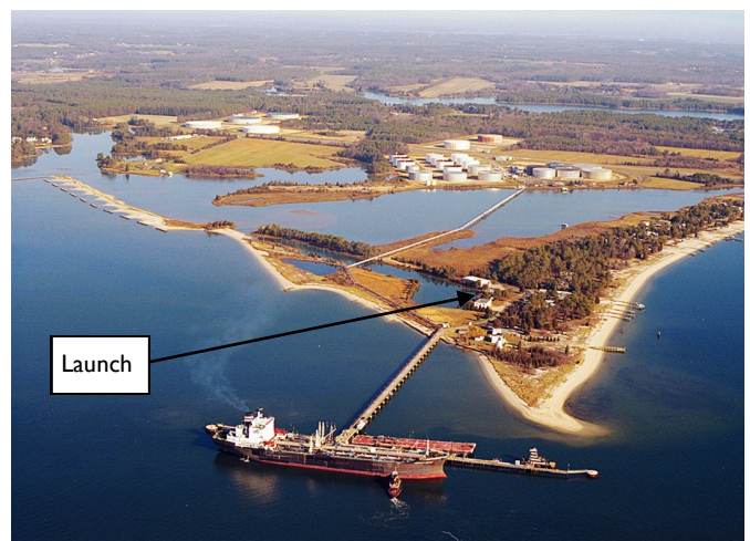
Overview of Piney Point Lighthouse launch area

Paddle Quest Maryland: http://paddlequestmaryland.com/