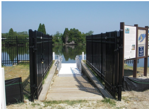
Piney Point launch approach

Further out Rt. 249 is a launch at the Piney Point recreation area, a boat ramp on the mainland side of the channel separating St. George’s Island. While the sandy area on the island side looks more inviting for a kayak launching, it is private property and posted. On the island itself is the Evans Seafood Restaurant, marked by a silo-like structure (good eats).