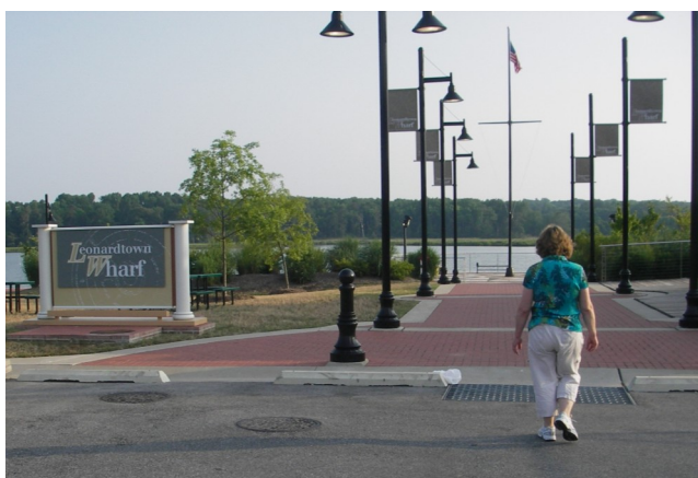
Approach to new Leonardtown Wharf

granted the colony, and more. We also peaked into the red one-room schoolhouse moved from elsewhere in the county, luxuriating in something the bygone school kids could only dream of: air conditioning.