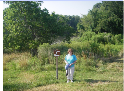
Canoe launch sign at Newtowne Neck State Park

One of my reasons for coming to St. Mary's County was the wonderful beaches at the end of the Newtowne Neck peninsula, between Breton Bay and St. Clements Bay on the Potomac facing St. Clement's Island. We'd stopped there paddling back from St. Clement's Island in May, and I'd heard rumors that the State of Maryland had recently acquired that part of the peninsula for a new state park. We drove