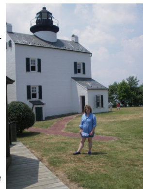
Replica Blackstone Lighthouse

We started out at one of the more familiar ones, launching our tandem SOT at the museum on Colton Point (park in the grassy lot beyond the paved museum lot and it's porta-potty) and paddling quickly over the half-mile separating us from St. Clement's Island. St. Clements (also known as Blackstone Island) was the site of the original landing of the Calvert expedition in 1634. The beach on the southeast shore of the island is one of the most welcoming on this part of the Potomac, and we landed amongst power boaters and jet skiers who also were making holiday. Now reduced to only 62.5 acres from the original 400 acres, St. Clements once boasted a lighthouse at its southeastern tip, built in 1851. Beth and I found a new, replica lighthouse had sprung up phoenix-like, and this time it was open for business. We climbed the spiral staircase of the central cupola and looked out on the 50 foot memorial cross erected in 1934 to commemorate the Calvert landing and the reconstructed bell tower with an original light house bell used to signal shipping when fogs settled in. St. Clements Island also has a large picnic pavilion in a grove of trees at the northeast corner, a walking path and promenade of trees planted to restore the original woodsy character of the island, and pit privy.