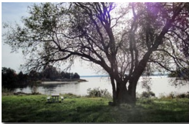
Newtowne Neck launch site

One of my reasons for coming to St. Mary's County was the wonderful beaches at the end of the Newtowne Neck peninsula, between Breton Bay and St. Clements Bay on the Potomac facing St. Clement's Island. We'd stopped there paddling back from St. Clement's Island in May, and I'd heard rumors that the State of Maryland had recently acquired that part of the peninsula for a new state park. We drove