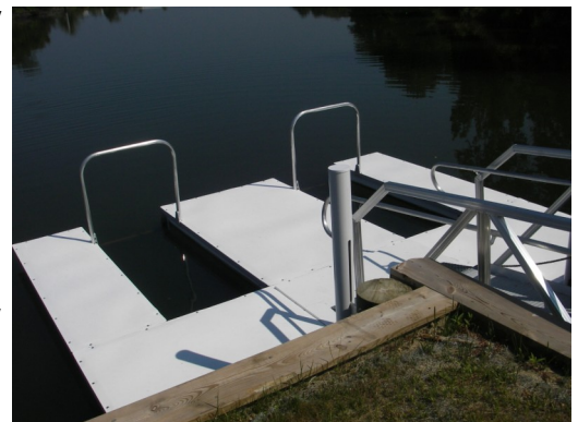
Kayak launch at Piney Point Lighthouse area

We ended our exploring weekend with Sunday dinner at Rips on Rt. 3 in